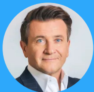
Robert Herjavec Cybersecurity Expert & CEO Cyderes